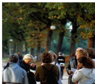
Open-Air Lesson on Lucca city walls

– The landscape of the hills and the culture of chestnuts: Visit to Colognora di Pescaglia and the Chestnut Museum to discover how the chestnut was fundamental to the life of the region.