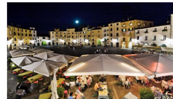
Piazza Anfiteatro in Lucca