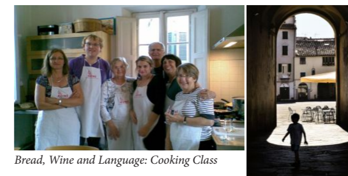
Bread, Wine and Language: Cooking Class